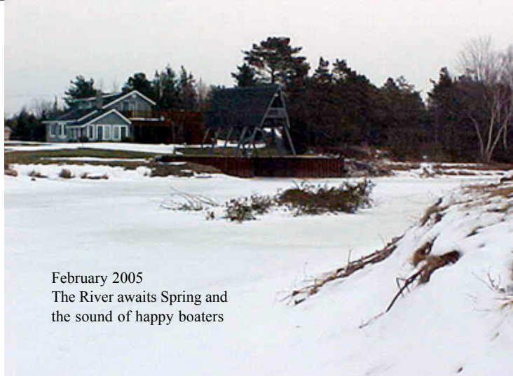
February 2005 The River awaits Spring and the sound of happy boaters