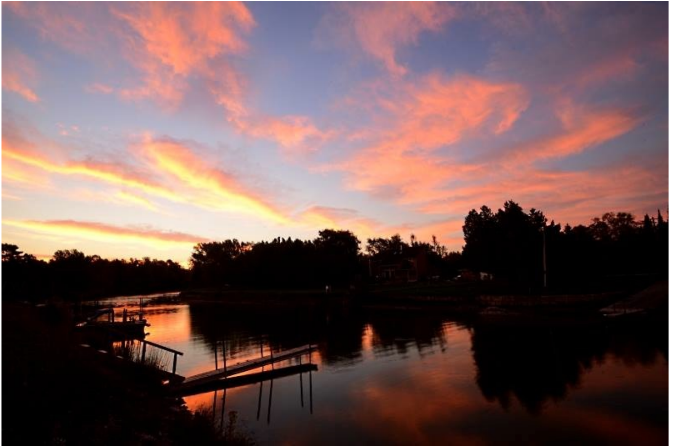
A sunrise at the Pine River Boat Club.