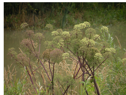
Hogweed! Avoid it!!

The club has for several years made a Fall donation to the Pine River Watershed Initiative Network and the Lake Huron Fishing Club. Both groups make a substantial effort to improve the environment in a manner of benefit to our members. The club is represented on the Board of PRWIN. If you have an interested in being the representative let us know.