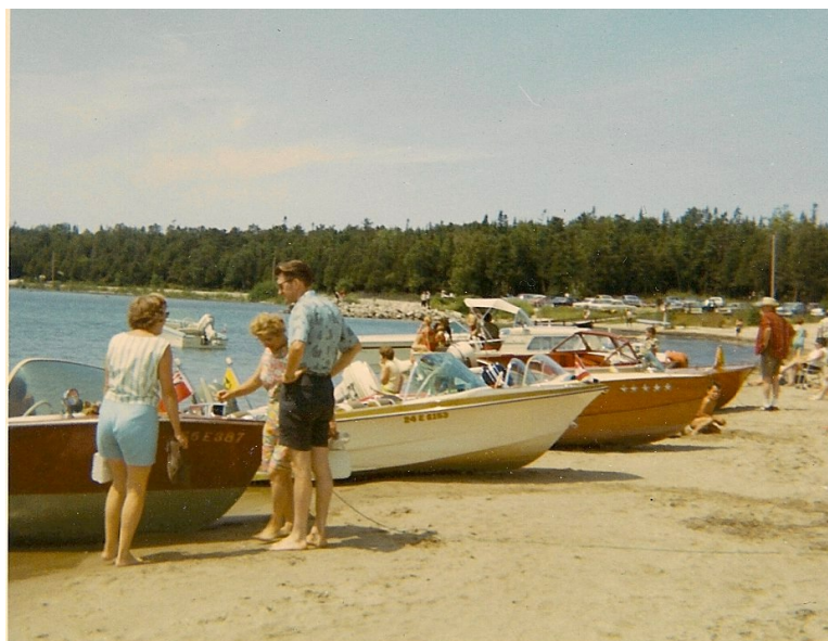
Members of the club ran to Inverhuron beach for a "Pirates Picnic" in the 60's

The On Time date for 2015 dues is March 1