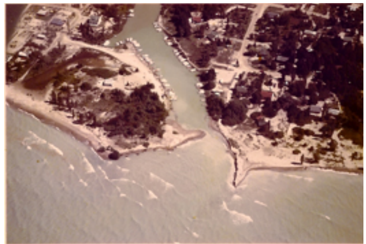
Arial View of the mouth of the river in the early 70's when high water induced silting in of the mouth of the channel. Note that at that time the north arm had not been constructed.

Depending on the quality of the Spring flush a Spring channel dredge may not be necessary. The Board is watching the situation and will respond if circumstances change. So far the lake levels remain high after years at low levels.