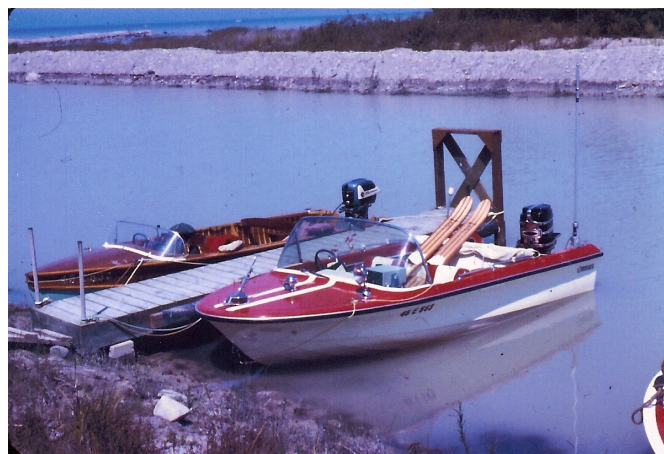
A typical dock and boats from the 1960's. The picture shows the clay on the North bank from the dredging of the river.

Dan Sevcik $250 on time 180 Oldfield Dr., $300 late Kitchener, ON Social $20 N2A 3S5