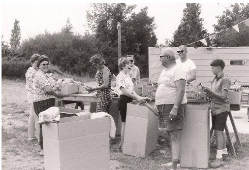
Early BBQ on the south side before the clubhouse

The 2023 financial statements for the Pine River Boat Club appear in the copy of the newsletter distributed to members but will not appear on the website.